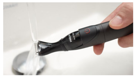
The trimmer and the combs are easy to clean under the tap.