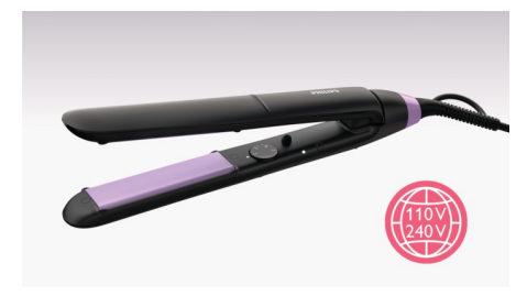
Compatible with 110-240 volts. Can be used wherever you travel in the world.