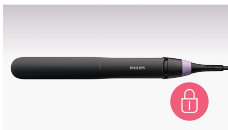
The plates can be locked together for safe and easy storage.