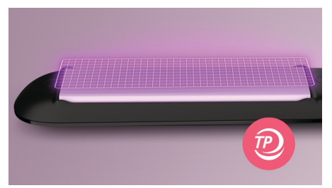
ThermoProtect technology distributes heat evenly across the plates, preventing overheating to protect your hair.