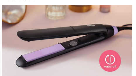
The styler has an automatic shut-off function for safe usage. It automatically switches off after 60 minutes.