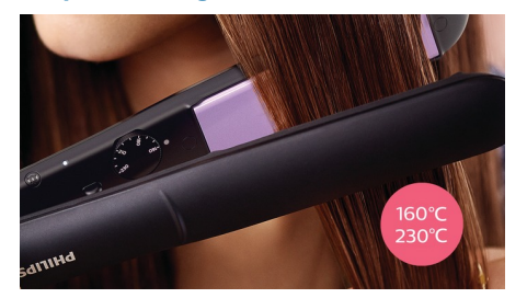
Choose between temperature range from 160°C up to 230°C to secure long-lasting result while minimizing risk of hair damage.