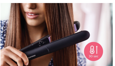
The straightener has a fast heat-up time, being ready to use in 30 seconds.